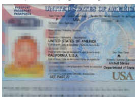
Passport bio-page (Image 02)