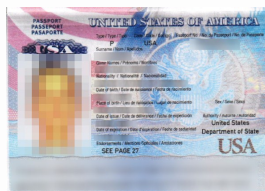
Passport bio-page (Image 01)